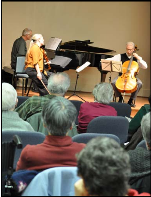
Cascade Manor, February 26, 2011 each concert.

This season Amici is giving free concerts for over a thousand kids at three public schools: Riverbend Elementary in Springfield, and Camas Ridge and River Road Elementary in Eugene. We are also collaborating with composition and music students at the Academy of Arts and Academics in Springfield, to perform their compositions with them in the Wildish Theater on June 7. Meanwhile, we have been giving free Saturday afternoon performances at Cascade Manor in Eugene before