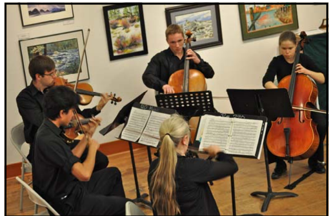
Emerald Art Center, reception, February 28, 2011