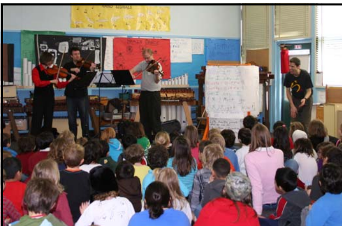
Camas Ridge Elementary, February 25, 2011

A high point of this season, thanks to our Art Contest Sponsor Vistra Framing and Gallery, was being able to contribute $500 again for scholarships at the UO Community Music Institute, where young people learn to love performing chamber music. The kids in this program played for an audience of 100 Chamber Music Amici ticket holders and art fans Monday, February 28, at our pre-concert reception at the Emerald Art Center, where Art Contest Finalists were on display and the People's Choice Award was announced. We love taking our music to those who can't attend our concerts and promoting a new generation of chamber music lovers.