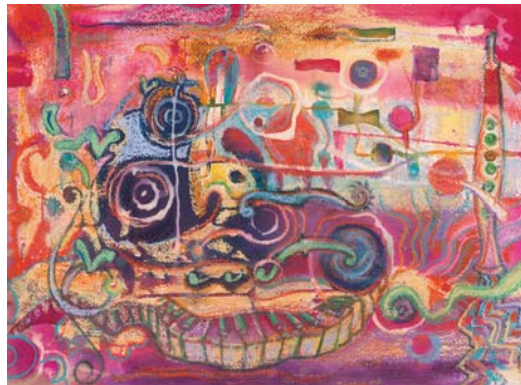
A Blend of Classical and Jazz L. Talaba