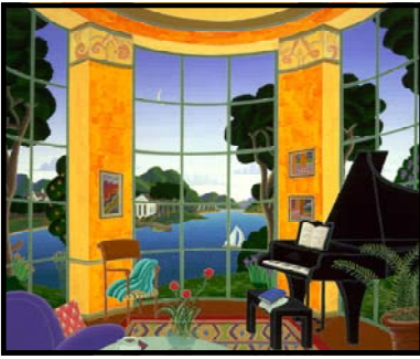
©2009 The Yellow Music Room