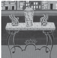
Reception on stage afterwards, Desserts from Excelsior Inn and Restaurant

Season Education Sponsors Chambers Family Foundation & Iser CPA