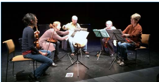
Mozart Quintet in rehearsal